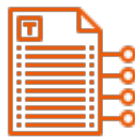
Technical Writing For Analytical Support