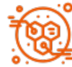
Advanced Characterization Strategies