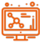
Technical Management Of Materials