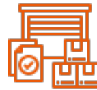
Creation & Management Of Materials Per Functionality Database