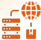
Material Database Creation

GVW's Material Science as a service is a value chain enabler that caters to both Chemistry and Manufacturing Controls (CMC) and Product Lifecycle Management (LCM) that encompasses (but is not limited to) the following functional aspects: