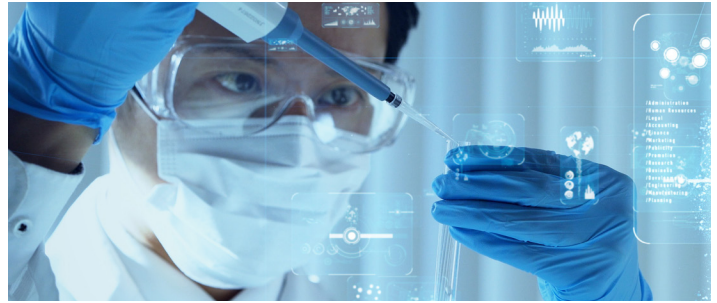
SampleManager XR enables analysts to review SOPs and record actions in LIMS as they work

Scientists are often burdened by manual processes and administrative tasks which divert their attention from real goals. As well as delivering productivity gains, applying innovative technologies in the laboratory relieves the scientist of some of those burdens and enables them to focus on science.