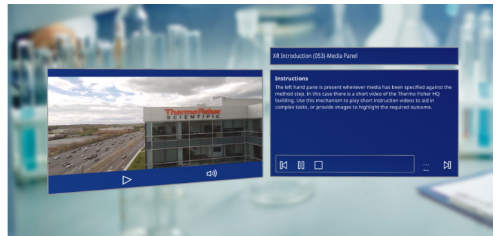
Scientists view multimedia process instruction through the LES as they work